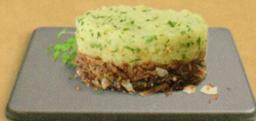
PARMENTIER DE CANARD