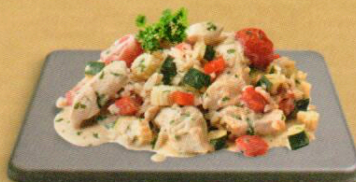
POULET CURRY VERT