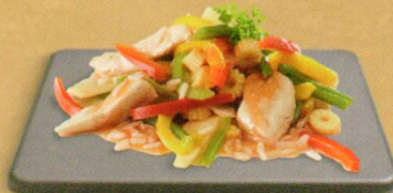
WOK DE POULET SAUCE AIGRE DOUCE