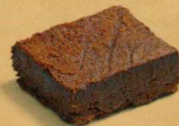
BROWNIE* 2.00 €