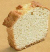
CAKE* 2.00 €