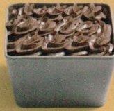
MOUSSE AU CHOCOLAT 2.50 €