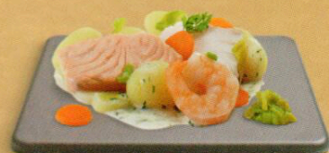
MARMITE DU PECHEUR