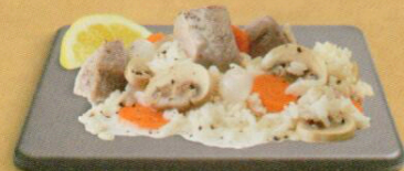
BLANQUETTE DE VEAU