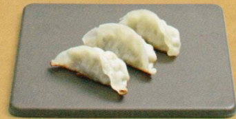
GYOZA* 3.50 € 3 RAVIOLIS JAPONAIS AU POULET ET AUX LEGUMES

KARE AGE* 4 PIECES OF FRIED CHICKEN JAPANESE STYLE