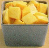
MANGUE FRAICHE 4.00 €