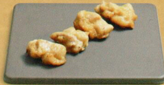
KARE AGE* 4.50 € 4 BOUCHEES DE POULET FRIT A LA JAPONAISE

YAKITORI CHICKEN* 3 CHICKEN BROCHETTES WITH TERIYAKI SAUCE