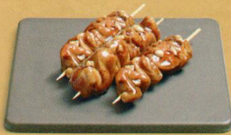
YAKITORI POULET* 5.00 € 3 BROCHETTES DE POULET A LA SAUCE TERIYAKI

YAKITORI CHICKEN* 3 CHICKEN BROCHETTES WITH TERIYAKI SAUCE